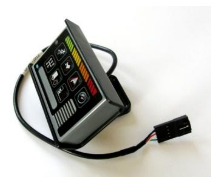
Figure 1: DFD

The DFD is designed to support and coach fleet drivers rather than to punish or preach to them. It is meant to be used as the driver's mentor for safety and eco driving, and continuous improvement.