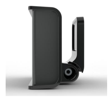
Figure 3: DFD Mechanical View